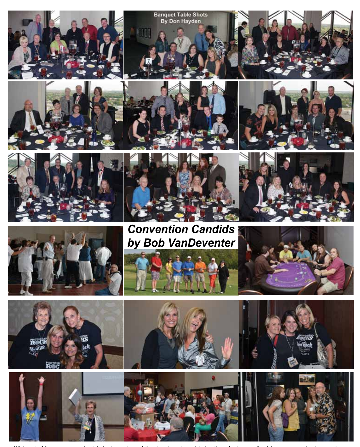
With only 16 pages to work with (to keep the publication in print), this is all we had room for. More to come in the next issue.